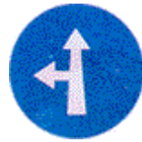
Compulsory Ahead or Turn Left