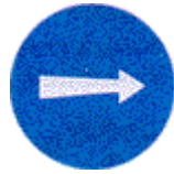
Compulsory Turn Right