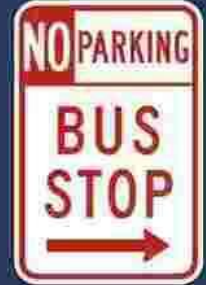
NO PARKING BUS STOP