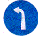
Compulsory Turn Left Ahead