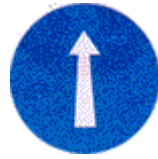
Compulsory Ahead Only