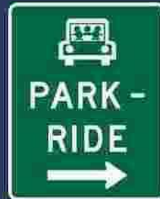
PARK & RIDE