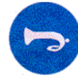
Compulsory Sound Horn