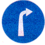
Compulsory Turn Right Ahead