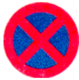
No Stopping or Standing