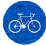
Compulsory Cycle Track