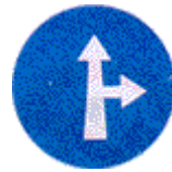
Compulsory Ahead or Turn Right