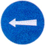
Compulsory Turn Left