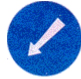
Compulsory Keep Left